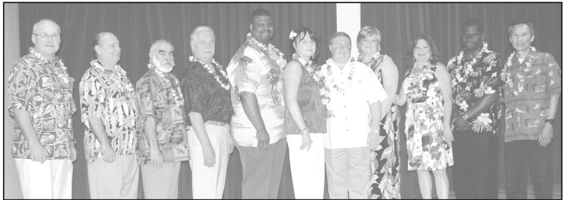
The members of the new Board of Directors were installed during the luau on June 17.